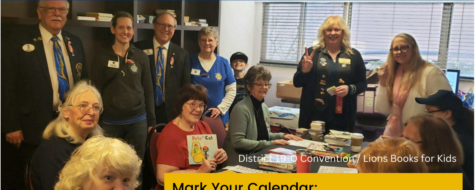
District 19-O Convention / Lions Books for Kids