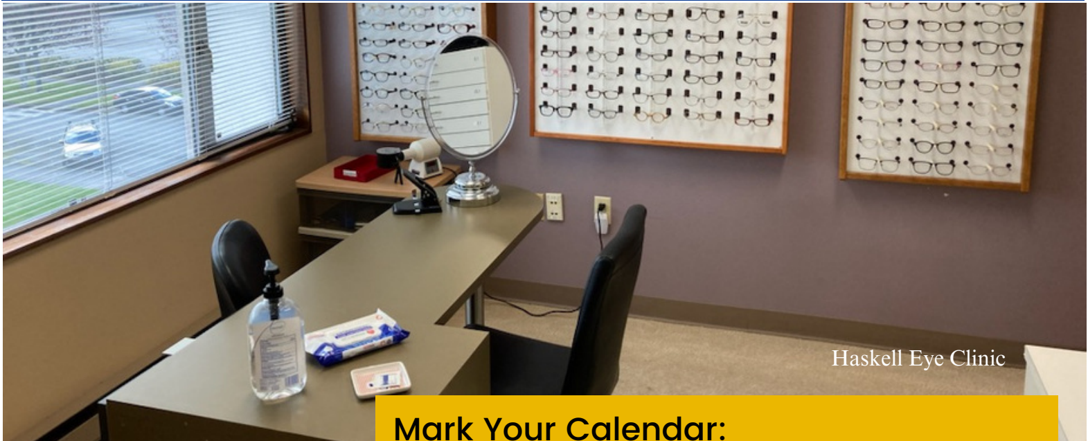
Haskell Eye Clinic