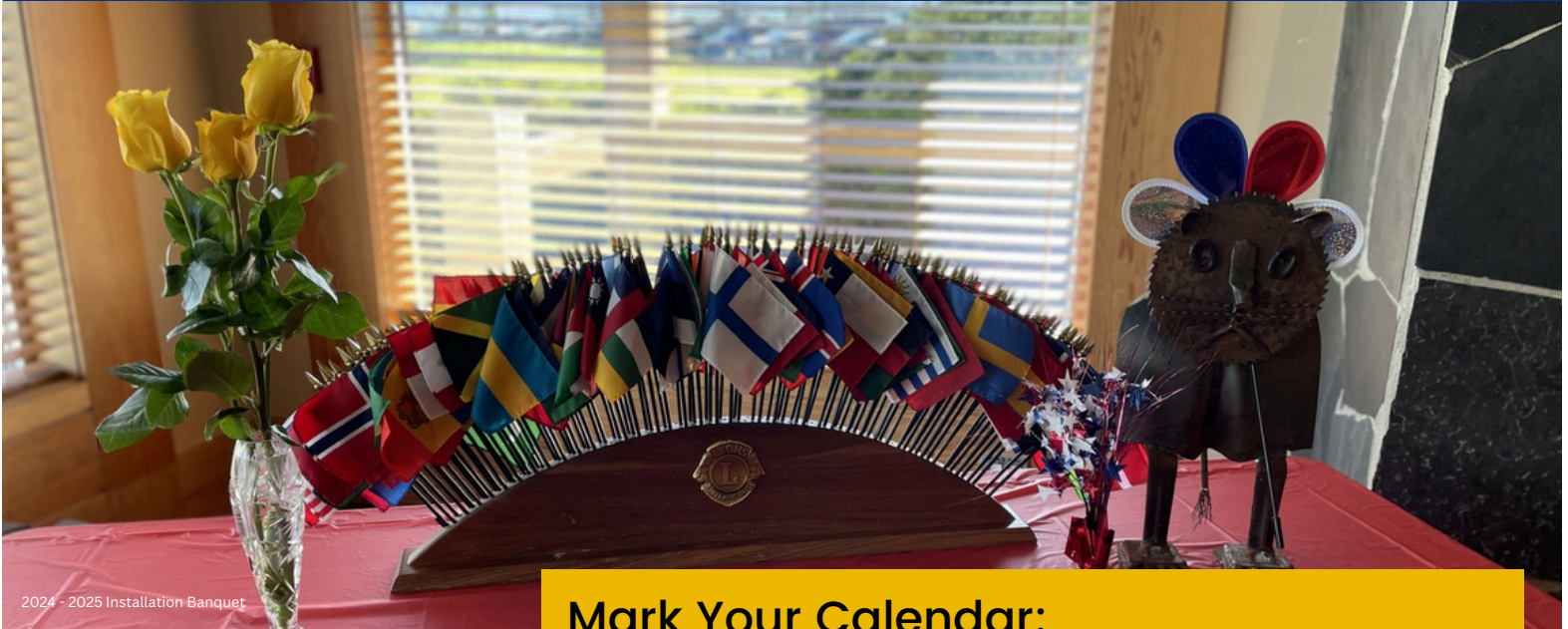
2024 - 2025 Installation Banquet