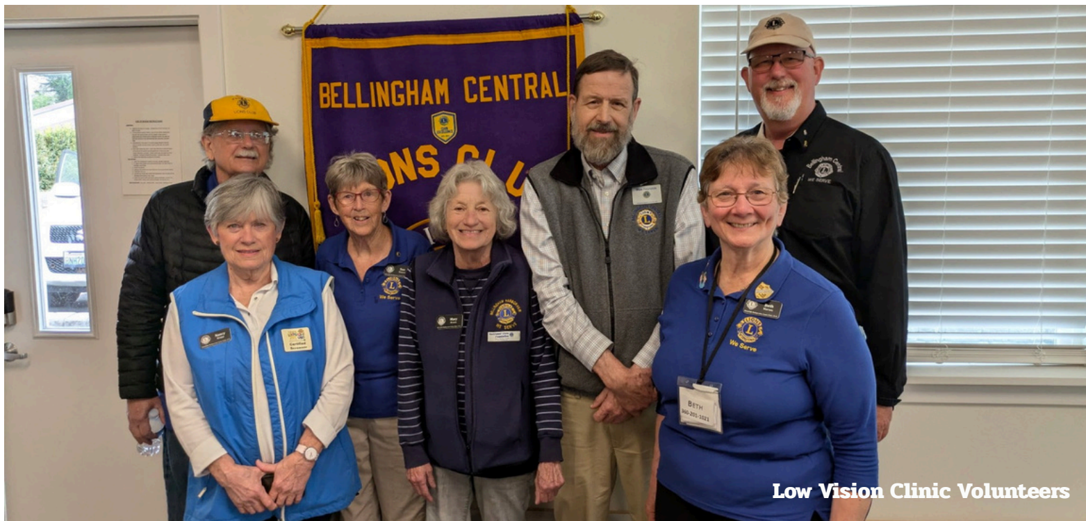
Low Vision Clinic Volunteers