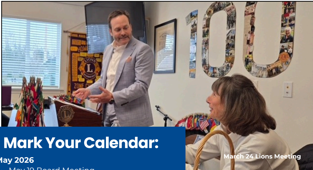
March 24 Lions Meeting