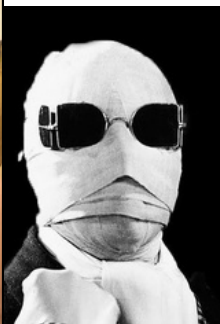
Feeling better after surgery